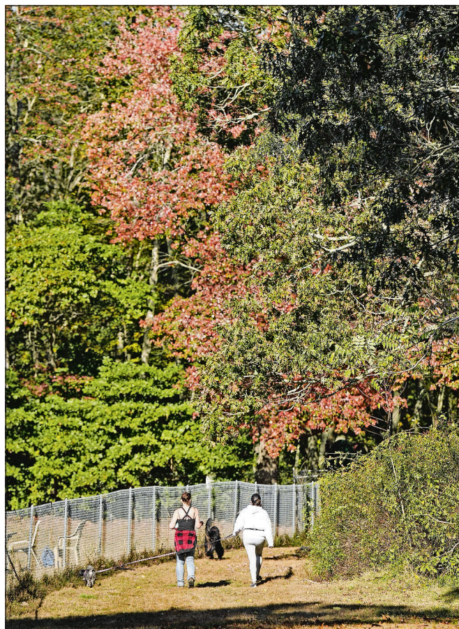
Dog walkers make their way past the dog park in the Copp Family Park in Groton on Friday.

has quite a bit of open space already, it faces the challenge that it is largely built out, unlike in more rural communities, so the city has to use the best of its abilities to find more available open space, Hedrick explained. The city could look at having landscaping included as part of the development of property to continue greening the city. Building higher vertically also allows for opportunity for future open space, but the city has to decide if it would want to do that and some people do not see that as desirable.